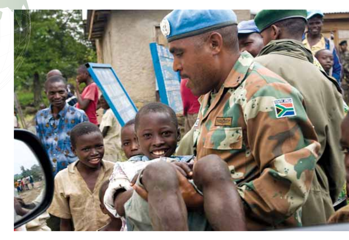
South African peacekeepers with the local population in the DRC.