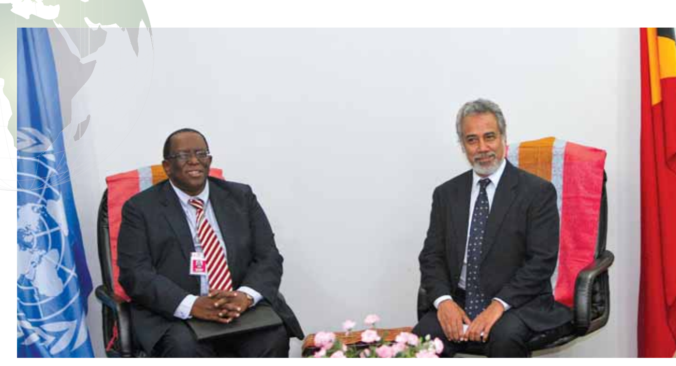
Ambassador Dumisani Kumalo as leader of the Security Council mission to Timor-Leste meets with its Prime Minister Xanana Gusmao, November 2007.

South Africa initiated a Security Council mission to Timor-Leste to gain a firsthand impression of the situation on the ground. South Africa also secured the immediate adoption of a presidential statement following the