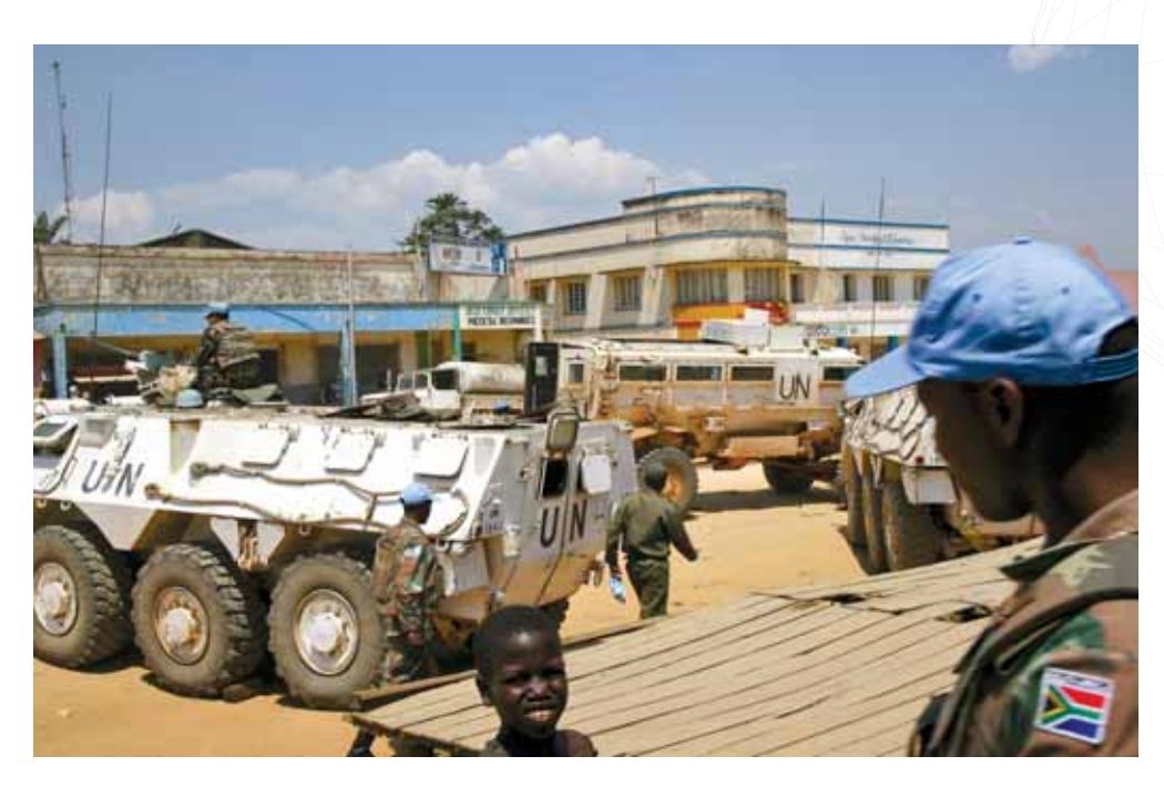
South African troops participating in the UN peacekeeping mission in the DRC.