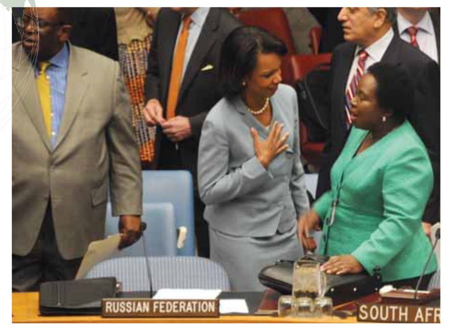
Minister Dr NC Dlamini Zuma and US Secretary of State Dr C Rice, at the Security Council meeting on Women, Peace and Security.

welcomed by the international community. South Africa is one of the few countries in the process of developing a National Action Plan, as called for in resolution 1325 (2000).